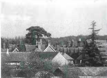
High Street roofscape