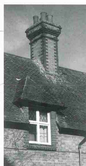
Details are important