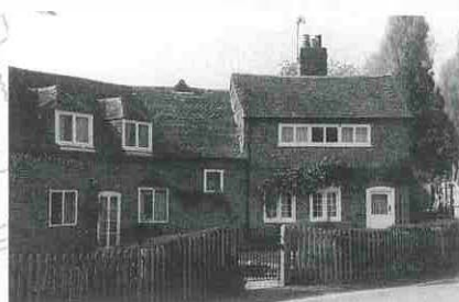
Abbey Gate Cottages