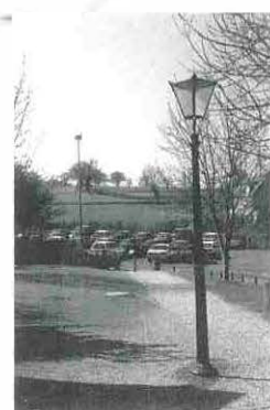
View out from rear of High Street